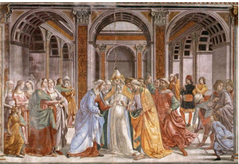
Golden Age of Europe (Renaissance 1400-1600)